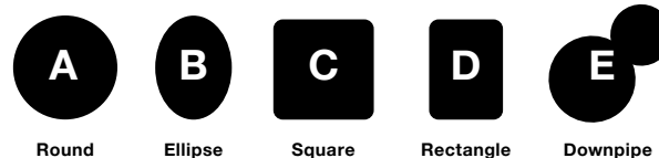
Fig.1 Post Shape We describe a post's shape as being the shape presented if the post were cut through, and or, viewed from above.

Comments / Additional Requirements: _____